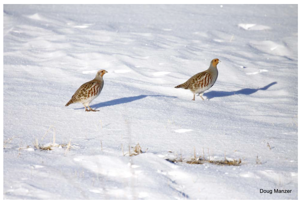
A grey partridge pair observed during one of our surveys.

Jid, one of the hunting dogs used during the upland bird survey, holding steady on point.